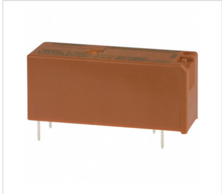
Gambar bisa berupa representasi. Lihat spesifikasi untuk detail produk.