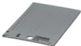
The figure shows a version of the article

Plastic label, Card, silver, unlabeled, can be labeled with: THERMOMARK PRIME, THERMOMARK CARD, BLUEMARK ID, BLUEMARK ID COLOR, mounting type: adhesive, lettering field size: 85.6 x 54 mm