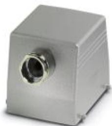
Sleeve housing, for double locking latch, height 80 mm, with screw connection, 1x Pg29, lateral cable entry

Please be informed that the data shown in this PDF Document is generated from our Online Catalog. Please find the complete data in the user's documentation. Our General Terms of Use for Downloads are valid ( http://phoenixcontact.com/download )